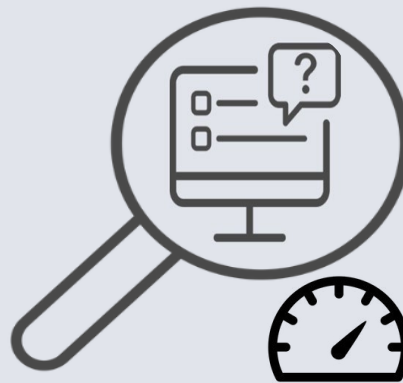
Maturity level analysis, -assessment & -visualization