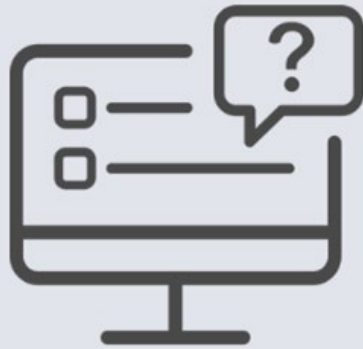
Best in Class Reference & Maturity Model (Questionnaire)

The interplay between maturity level questionnaire and maturity level assessment → The existence of the digital basic elements (DBE) respectively the standardized, elementary, digital capabilities ( \hat{=} DBE) as well as their generic and/or industry-specific characteristics (good & best practices) is analyzed, weighted and then visualized on the basis of the maturity level questionnaire.